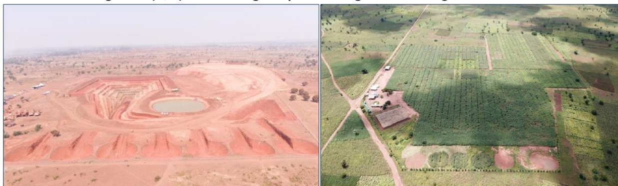
Figure 1: (A/B) Pilot mining site post-mining and following rehabilitation